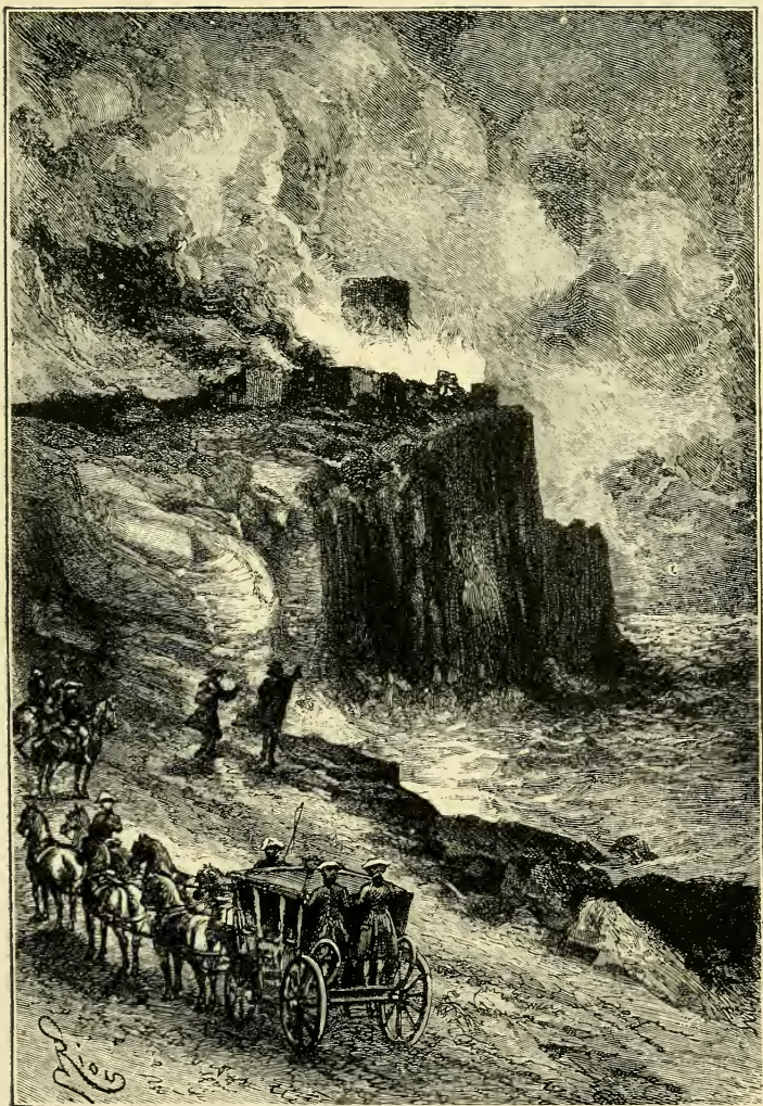
The Fire at Wolf's Crag.